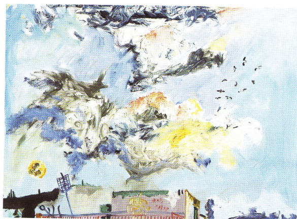
Untitled, oil on canvas, 50x70 cm